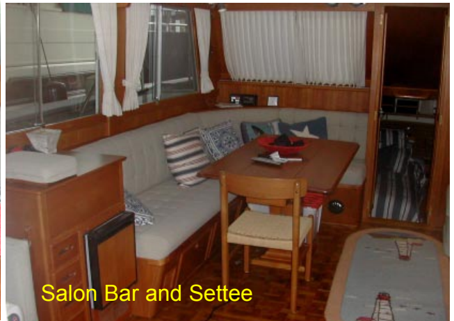
Salon Bar and Settee