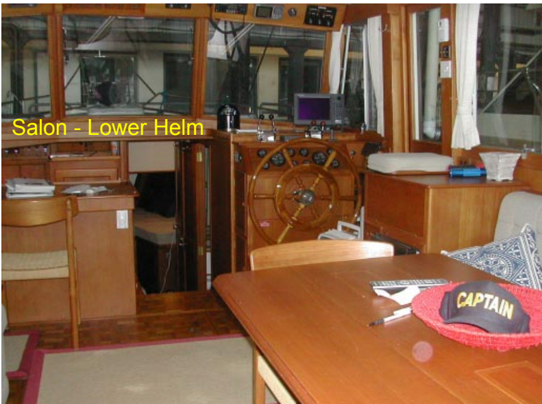
Salon - Lower Helm