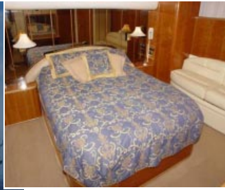
Photos include running profile, evening profile, master suite, and salon.